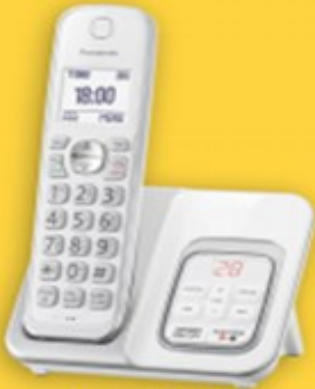
Charity No. 250306

We aim to help every believer to discover the gifts and talents God gave them ( Ephesians 4:11-16 ).