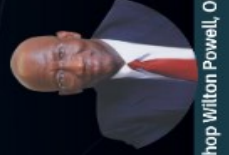
Bishop Wilton Powell, OBE